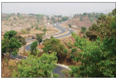
Mumbai Nasik Expressway, Maharashtra, India

To meet the requirements of a manufacturing base in India,