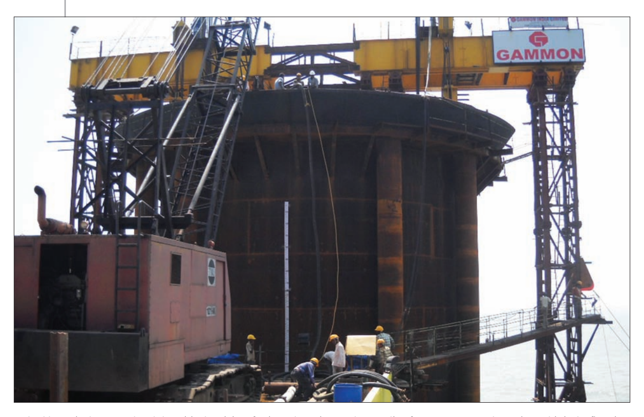
Kalpakkam site has completed the critical activity of caisson lowering and grounding for Sea Water Intake project. This is the first time Gammon has launched such a large caisson of 21 metres over cofferdam using latest technologies and a totally different technique that too in rough sea.

were also rumours that tsunami would make a comeback again. Even though Gammon India's workers colony was not too far from the sea, there had been no loss of life due to tsunami although people had lost all their belongings in the tsunami. Under such circumstances workers were not ready to come back and work got held up. This is when, the senior officials of Gammon India decided to go and stay in the workers' colony to re-instill confidence in them. This had a magical effect, workers started returning and work resumed soon.