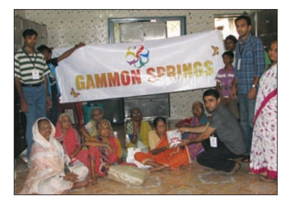
Gammon Springs volunteers donated 650 kgs of foodgrains to Help Age India, an NGO working for cause and care of elderly people.