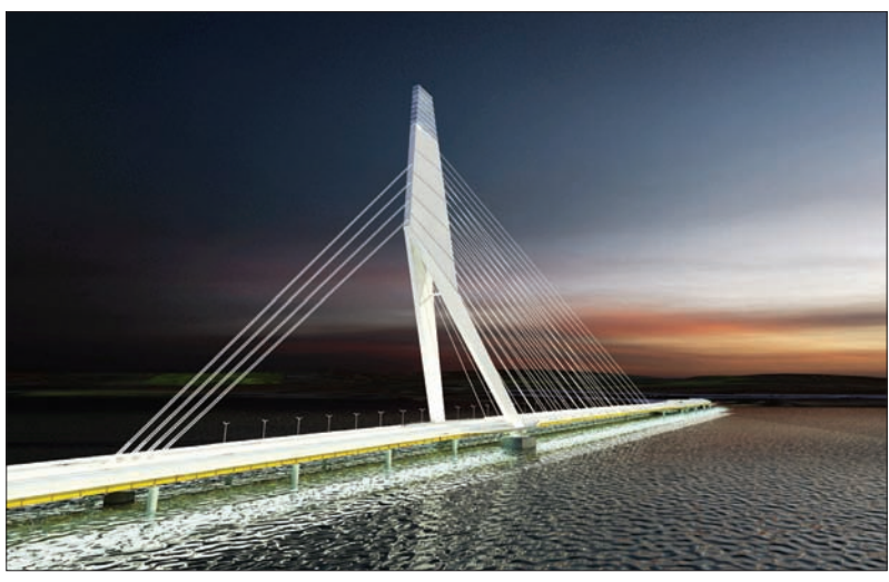
A schematic presentation of the Signature Bridge

a. Unique cable-stayed bridge structure-first of its kind in India and amongst very few in the world