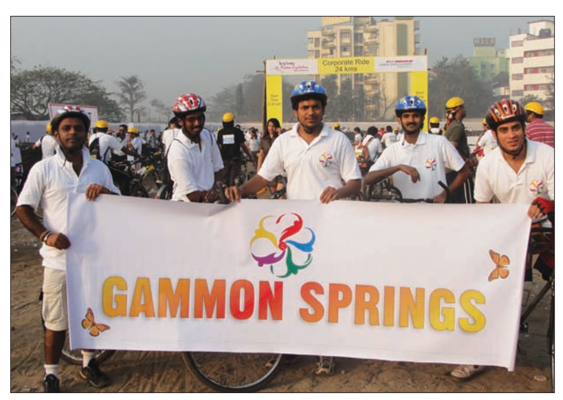
The five-member team that participated in the 24-km BSA Hercules India Cyclothon, Mumbai, February 21, 2010.